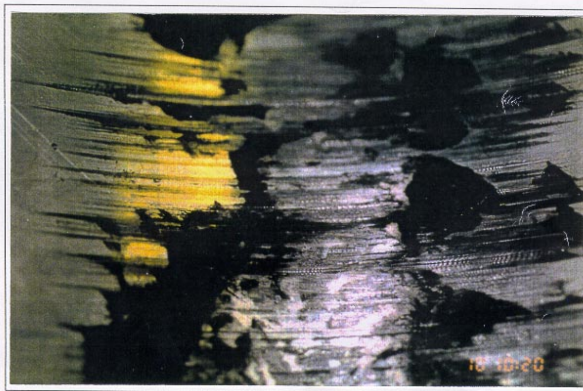
Fig. 2. Blackened and pitted bore