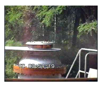
Fig. 2: Large, small and no shield

Based on this experience, we recommend that you check the relief valves on your engines and if equipped with such shields, we recommend that these be removed as soon as possible.