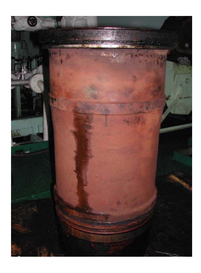
Fig. 10: Cooling water-side of cylinder liner. Cylinder liner O-rings for the cooling water spaces were renewed after inspection and cleaning