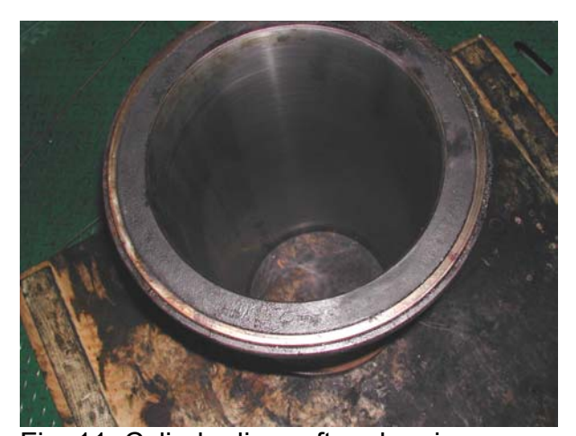
Fig. 11: Cylinder liner after cleaning