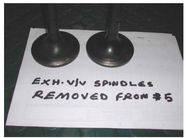
Fig. 3: Exhaust valve spindles