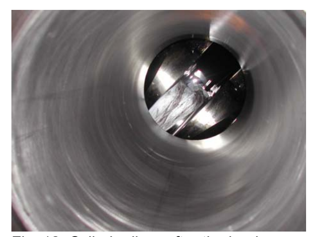
Fig. 12: Cylinder liner after the honing process