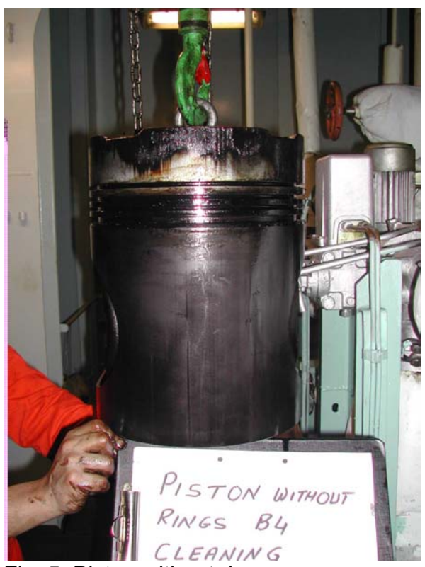
Fig. 5: Piston without rings