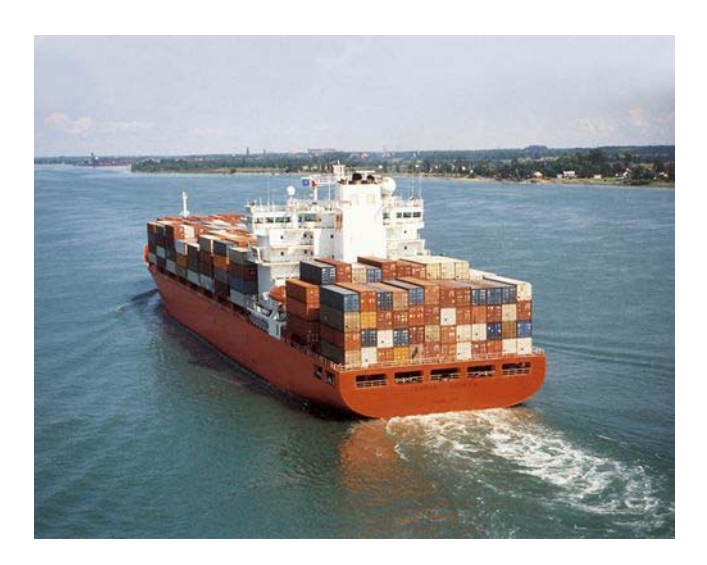
Fig. 1: CP Ships '96- and '95-built 2200 TEU container carriers M/V Canmar Courage and M/V Canmar Fortune – supplied by Korean Daewoo Heavy Industries