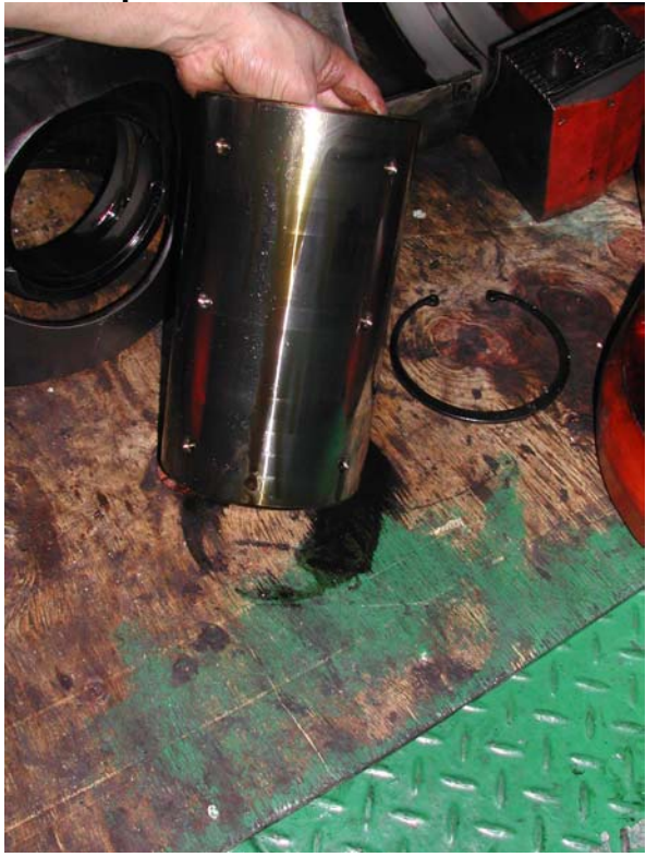
Fig. 13: Piston pin removed for calibration