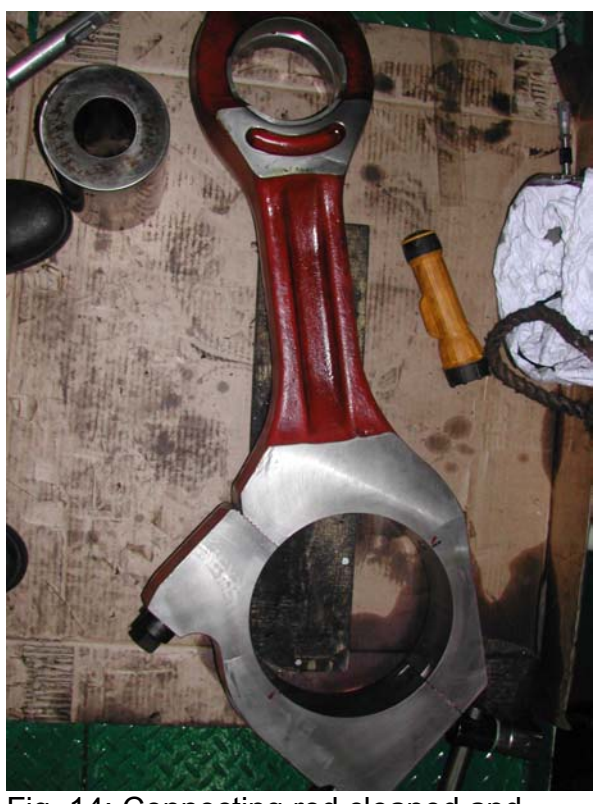
Fig. 14: Connecting rod cleaned and assembled for calibration measurements