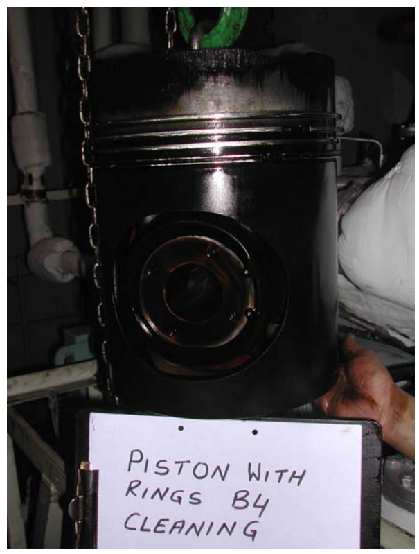
Fig. 4: Piston with rings