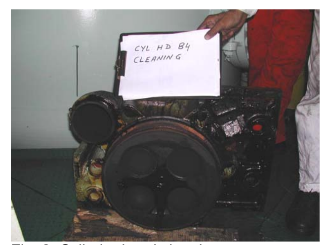
Fig. 2: Cylinder head cleaning