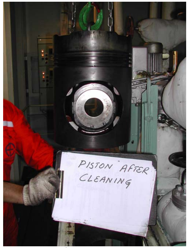
Fig. 6: Piston after cleaning