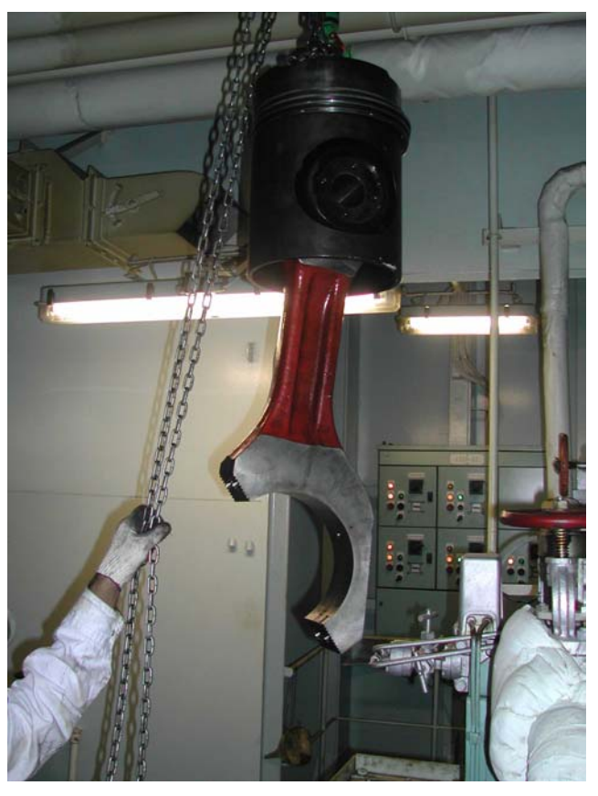
Fig. 7: Piston with new rings ready for installation